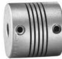
Set Screw Type (ES)