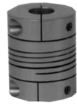
Clamping Type (EC)